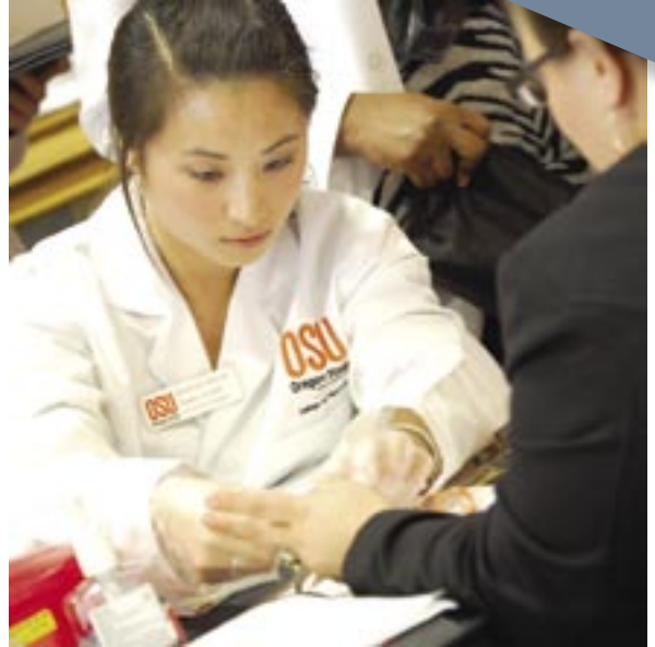
Students are incorporated into clinic and hospital-based patient care.