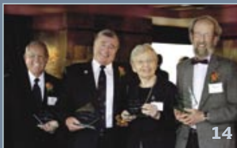
2011 Icons of Pharmacy