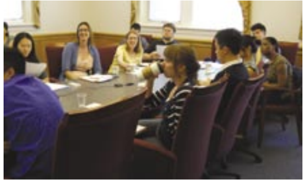
Students working on their Pharmacy “Business Plan.”

A project of the Entrepreneurial Academy is the development of a “Business Plan” intended for submission to the NCPA national competition. The students met in June to begin formulation of their business plan concept. Don’t be surprised if they contact you for your input, expertise or support! Learning about accounting, reading and creating balance sheets and financial documents, developing a marketing plan, considering inventory management, integrating management skills and combining the many facets of pharmacy management are the outcomes of this student project. Participating students will gain exceptional knowledge and experience. Come and be a part of this project!